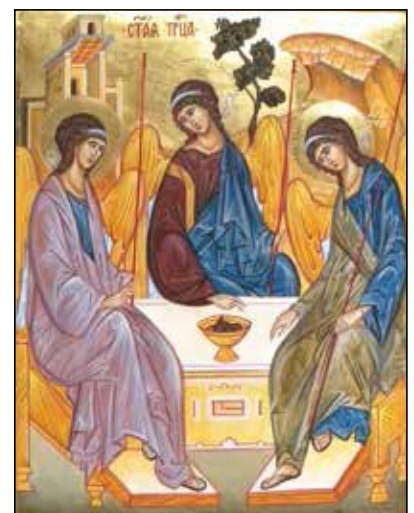
The Trinity, Andrei Rublev