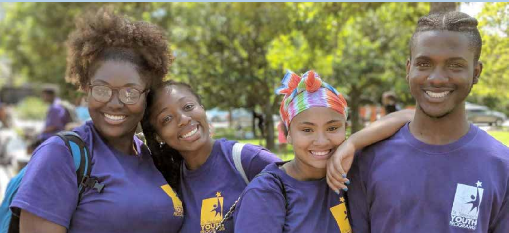
St. Stephen's B-SAFE Youth Program

"From the start, everyone was willing to teach me how things are done here. I was welcomed. Above all, the love of Christ at St. Andrew's through all its members made it so easy for me to do the same—to serve God and the church."