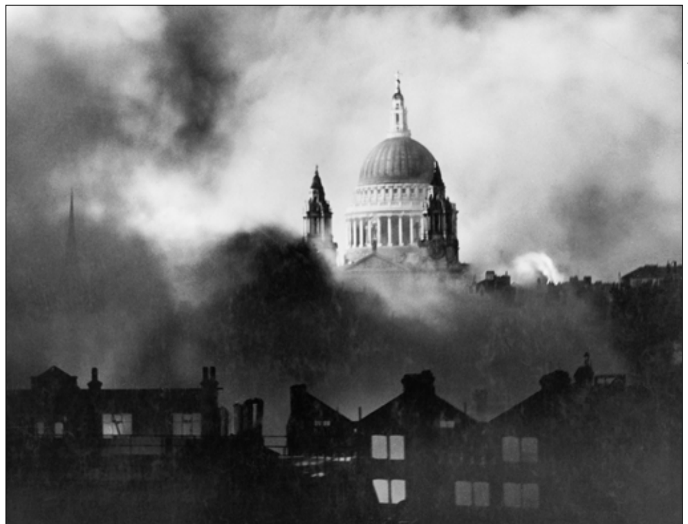
St Paul's Cathedral during the great fire raid in London, December 29, 1940.

Where are you already performing selfless acts? Where are you being invited to do more? Blessings in your discernment around these questions. You will be making the world a more abundant life-giving place.